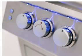
All Stainless Steel Construction

Heat Zone Separators Can Vary Temp 80 -100 Degrees