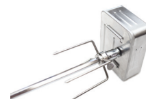
Rotisserie Kits Available