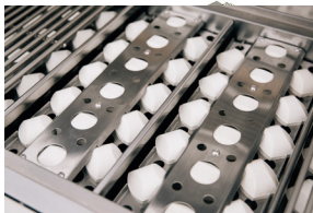
Easy-Clean Briquette System