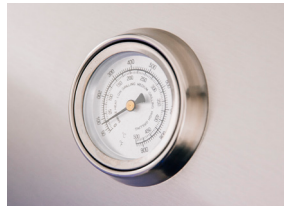
14,000 BTU Stainless Tube Burners