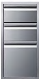
Three Drawer Stack 15" VGC15DB3