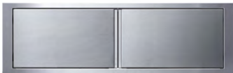
Lower Doors Elite VGC42AD