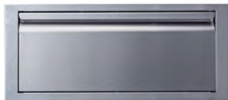
Lower Drawer Pro VGC30LD1