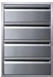
Four Drawer Stack 21" VGC21DB4