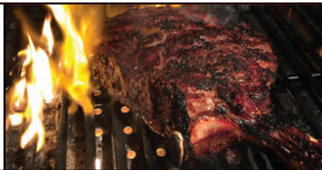
DIRECT FLAME INSERT FOR SEARING!