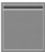
Vertical Access Door VG21SB