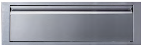
Lower Drawer Elite VGC42LD1