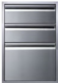
Three Drawer Stack 21" VGC21DB3