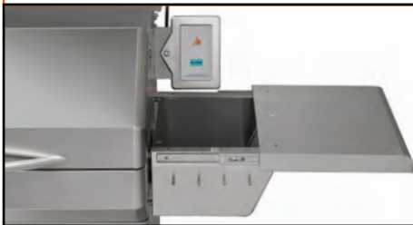
SLIDING TOP SHELVES!