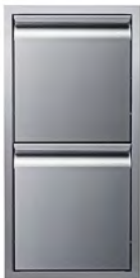
Two Drawer Stack 15" VGC15DB2