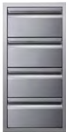
Four Drawer Stack 15" VGC15DB4