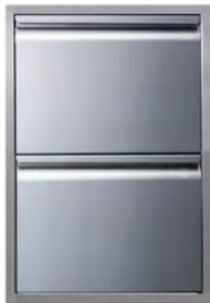
Two Drawer Stack 21" VGC21DB2