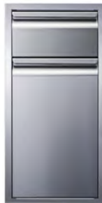
Single Drawer and Trash Drawer 15" VGC15BWB1