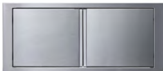
Lower Doors Pro VGC30AD

Memphis Wood Fire Grills' line of 304 stainless-steel drawers and doors will complement any outdoor kitchen setting. Our accessories match our Pro and Elite Built-in Wood Fire Grills and will fit seamlessly into any masonry island. A variety of cabinet options are made with soft close stainless steel slides that hold up to 100 pounds. Additionally, there are stainless steel doors and a large drawer designed to fit underneath our Pro and Elite Built-in models, matching the width of the specific units for a streamlined design and providing the ultimate in space savings and convenience.