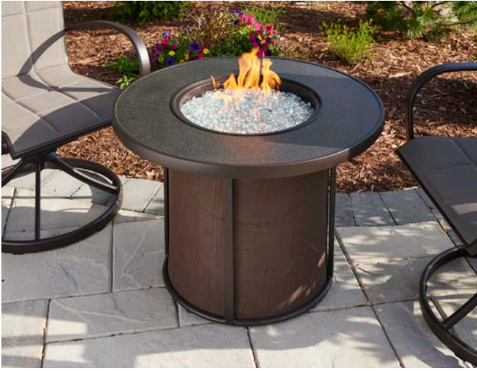
DORA BROWN STONEFIRE FIRE PIT TABLE