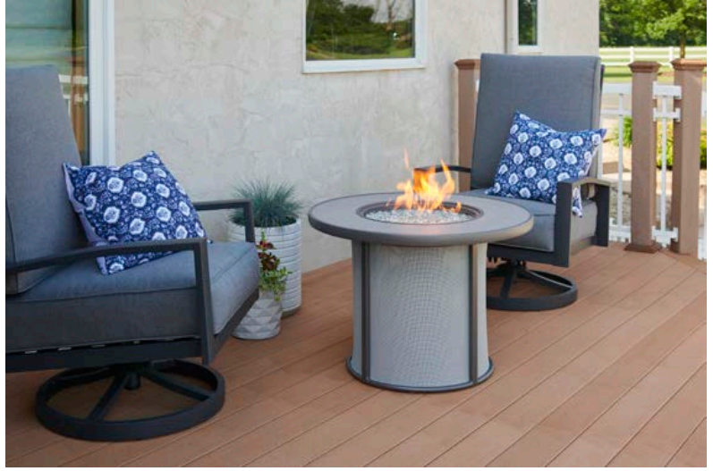
GREY STONEFIRE FIRE PIT TABLE