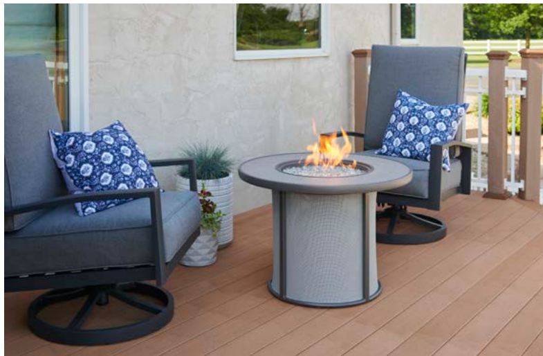
DORA BROWN STONEFIRE FIRE PIT TABLE