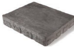
LARGE RECTANGLE 13¾" x 16½" x 2¾" (35cm x 42cm x 7cm)