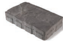
MEDIUM RECTANGLE 13¾" x 8¼" x 2¾" (35cm x 21cm x 7cm)