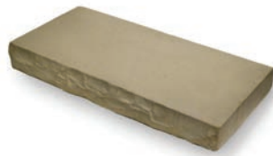
CLOSED END COPING 12" x 24" x 3" (30.5cm x 61cm x 7.5cm)