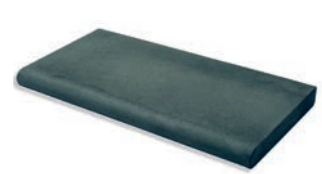
FULLNOSE UNIT 12" x 24" x 1 3/4" (30.5cm x 61cm x 4.5cm)