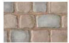
Dawn Mist / Pebble Taupe Blended on site