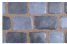
Basalt / Belgian Blue Blended on site