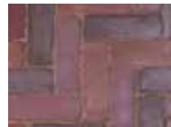
Three color mix (Blended on site)